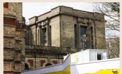
The north-east tower

Work on the regeneration of the Theatre is under way. Contractor Willmott Dixon began work on January 25 on a package of enabling works to prepare for the main project work to start in the summer. Some internal walls under the balcony and in the north-east tower have been removed, along with the modern ceiling in the foyer, revealing the vaulted roof above. As well as preparing the site, surveys are being carried out on various parts of the structure, including the plasterwork, to help complete the detailed design specifications. We will be getting a full update on progress from Louise Stewart at the AGM.